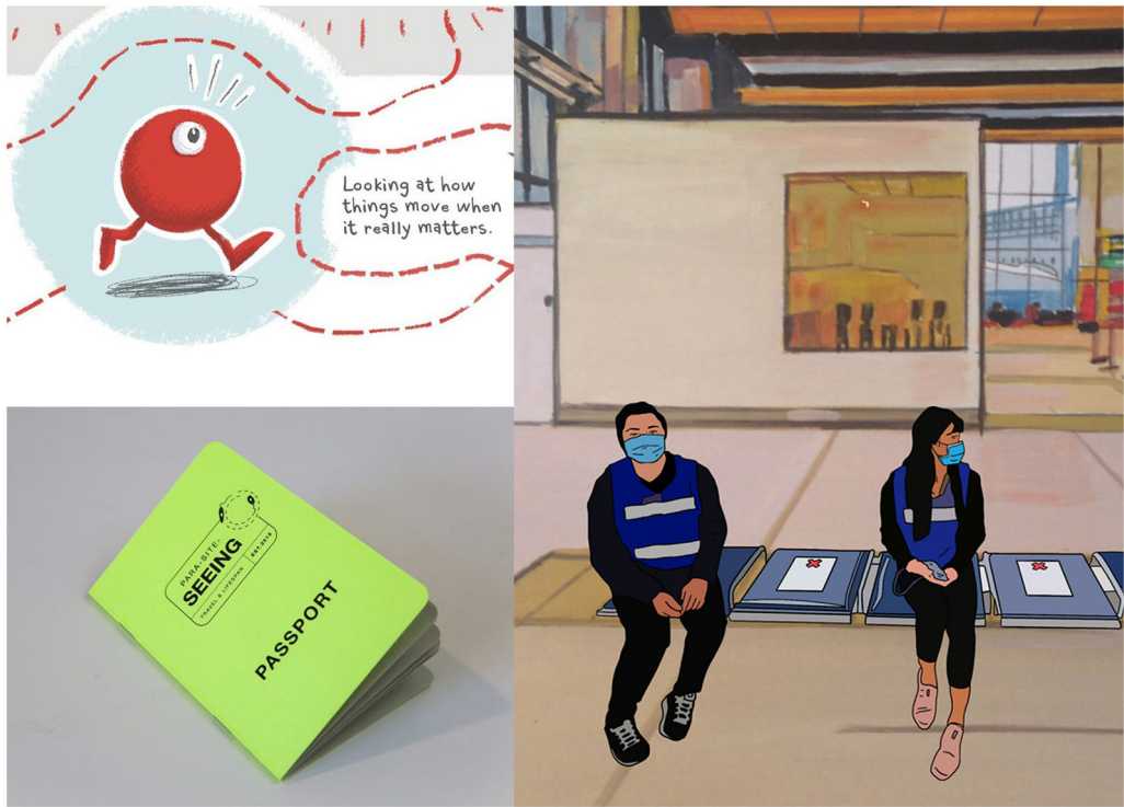
Figure 3. Close up of Blood Journey , by Stephanie Sodero (top left); Para-Site-Seeing by Rod Dillon and Southern (bottom left); Pandemic Airport , by Clare Booker (right).

2012). Through expertly staged events visual and theatrical methods enable connections to be made, and discussion to flow around emerging and often invisible or unspoken im/mobilities.