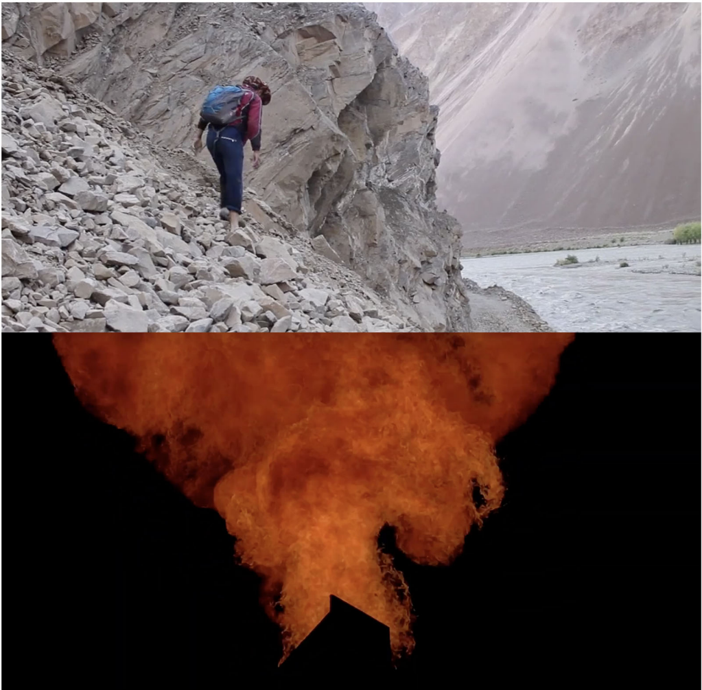
Figure 6. Screenshot of On the Bartang roads , by Suzy Blondin (top); Earth , by Max Schleser and Martin K Koszolkó (bottom).

neighbourhoods made strange by the times. As an artist who explores transport infrastructure, and whose professional trajectory is bound up with my own mobility, I wanted to witness the confrontation between the vectors of global mobility and those of its coronavirus counterpoint, and to find early signs of how my status as an artist was being reconfigured.