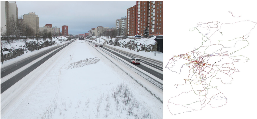
Figure 7. Close up of Invisible Tramline , by Aleksandra Ianchenko (left); Lockdown in Lancaster and Morecambe , by Louise Ann Wilson (right).

biennials. If artists, such as I, continue to explore airports, it is to pick through the debris of these entanglements, and rescue what is still serviceable (Figure 5).