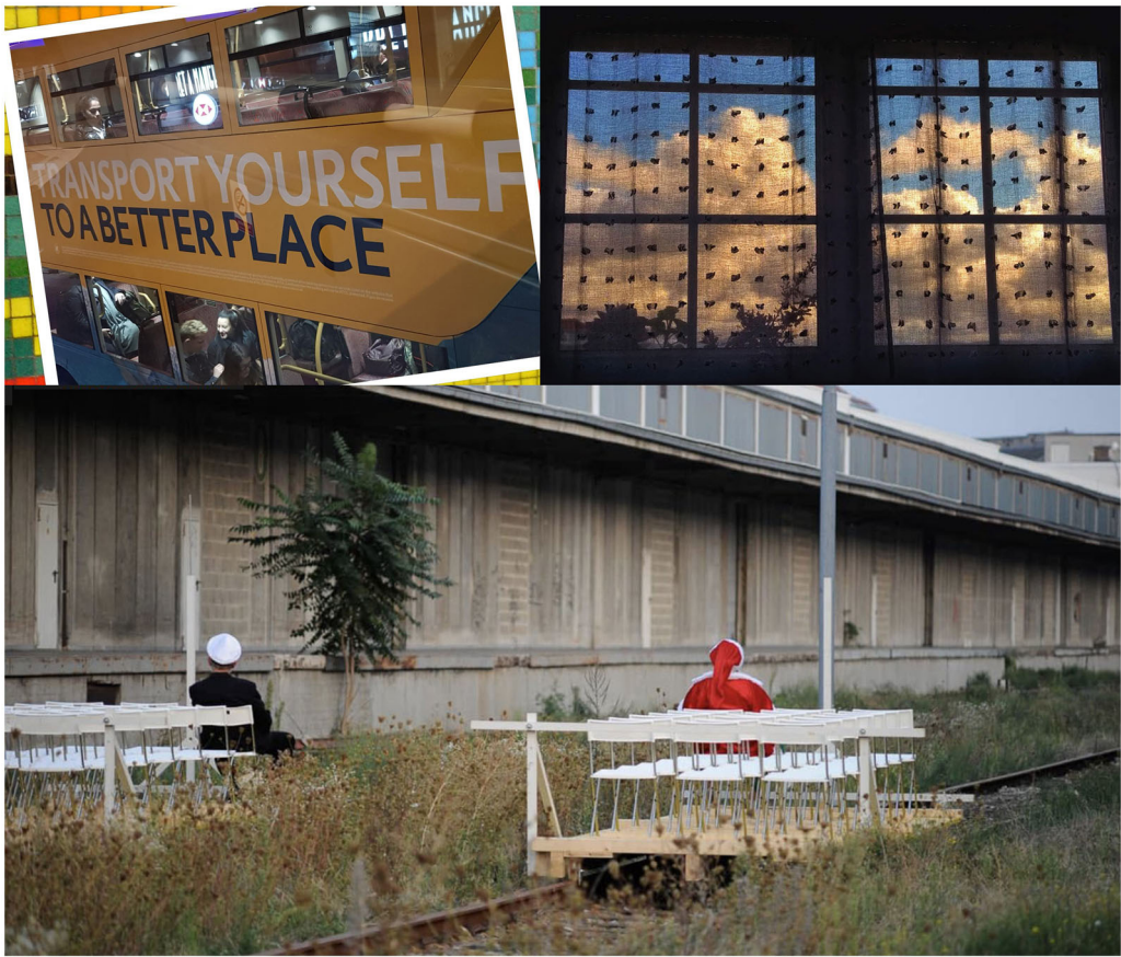
Figure 2. Close up of Transport Yourself to a Better Place , by Janet Bowstead (top left); Quarantine notebook , by Catarina Sales Oliveira (top right); screenshot of Nordwestpassage , by Michael Hieslmair and Michael Zinganel (lower).

a women's centre with women who were beginning to resettle. Over weekly sessions, participants used their photography and captions to communicate their experiences of mobility, producing images, maps and collages for themselves, for the group, for display in women's services, and for wider presentation through the research. The sessions built confidence in both creativity and in sharing their insights, with the concern to make safely visible their isolated and hidden journeys. Women explored their experiences of displacement and resettlement, and brought their individual images together into collages to show their collaboration. Whilst recognising what they had lost, women also focused on what they could take with them, and on sharing messages of strength and hope to reach other women they imagined making similar forced journeys.