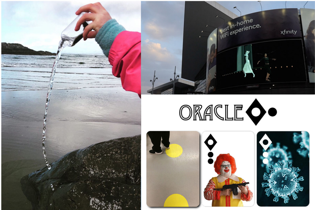
Figure 8. Screenshot of S Project , by Gudrun Filipska and Carly Butler (left); out of isolation came forth light , by Tess Baxter (top right); Oracle , by Heidi Wood (lower right).

mobile equipment with an array of recording and sound manipulation options, allows for sampling of natural soundscapes and rapid music and video creation in natural settings.