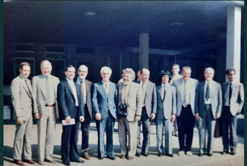
Suckling Pic in Hellange after the conference in Wadgassen 2018