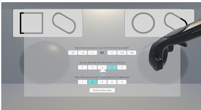
Fig. 2. Post-trial questionnaire on time estimation, time perception, and fatigue.

The sorting attempt has a predefined duration unknown to participants. After this duration, the experiment ends with a questionnaire in which the participants are asked to estimate the time in seconds and rate on two Likert scales how fast the experiment felt and how tired they were (cf. Fig. 2).