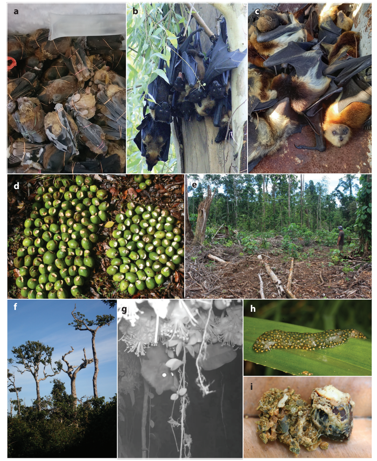
(Caption appears on following page)