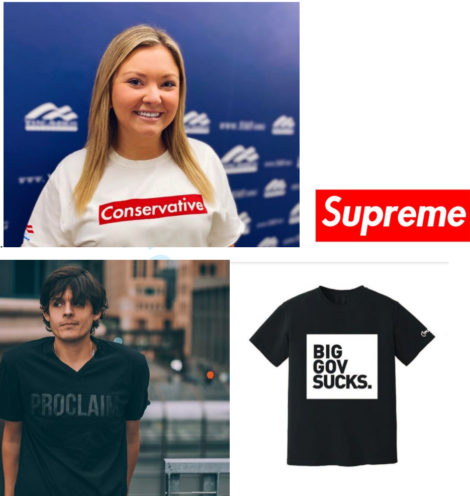
Figure 3 a-d. a