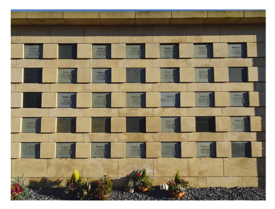
Fig. 3.5 Columbarium at Notre Dame cemetery. Each niche has the same cover, made of grey stone with 'famille' and the family name in the same black lettering. No alternative designs are offered.

Coptic Egyptian man, who had buried his mother two years earlier, explained in detail how he managed to secure a family grave in Luxembourg. Upon asking him if his mother did not wish to be buried in Egypt, he answered: