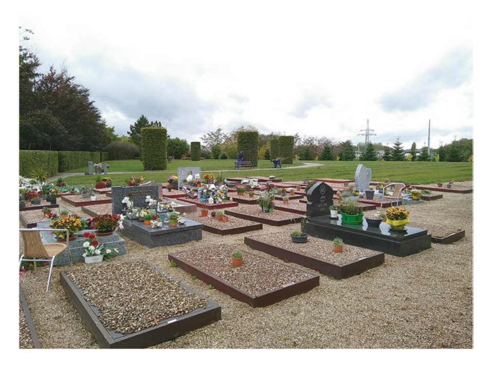
Fig. 3.3 The Muslim section of the Merl cemetery. While all the grave plots are of a similar size and orientation, the decorations reflect personal preferences and traditions in various countries of origin.