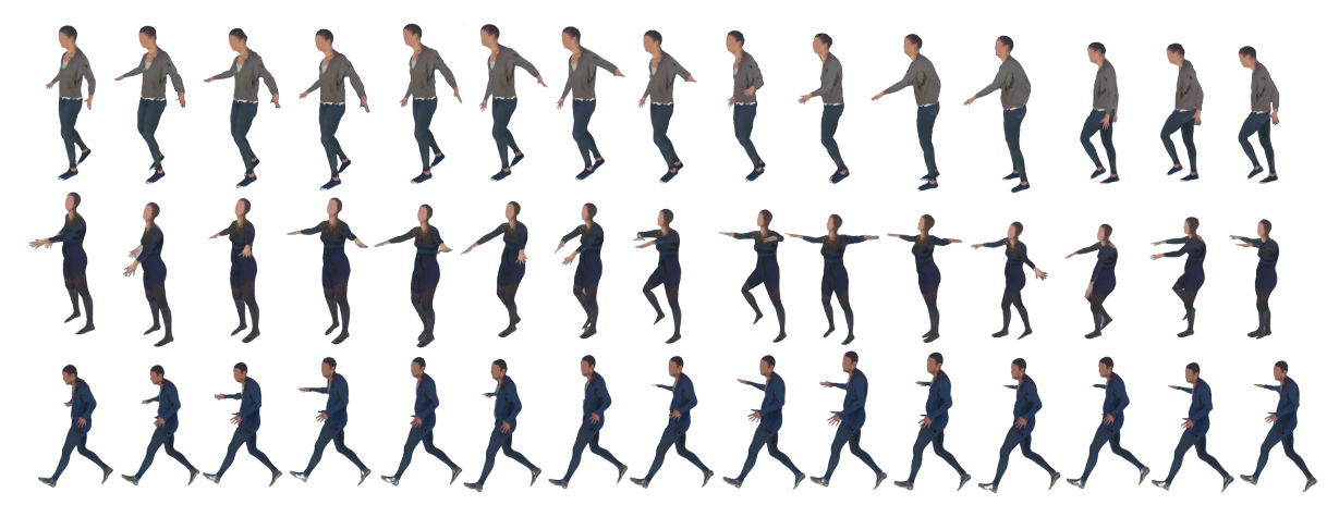
Figure 3: Samples of generated dances. Each row represents 15 frames corresponding to 1.5 s of the generated dance. The dances are generated with a frame rate of 60 fps.

around 500 different human subjects with a high-resolution texture. Each participant has been captured in at least 3 poses. The scans are captured in both close-fitting clothing and arbitrary casual clothing. Additionally, the texture is evenly illuminated and reflects the natural appearance of the body.