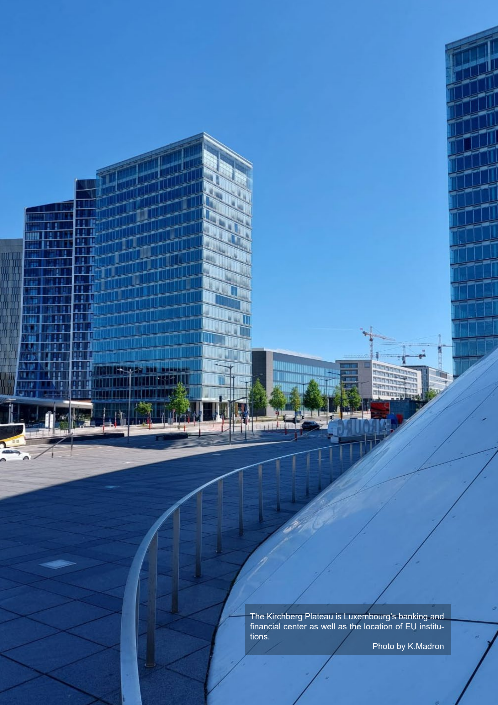
The Kirchberg Plateau is Luxembourg's banking and financial center as well as the location of EU institutions.