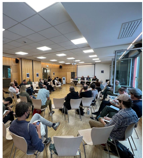
Snapshots of INURA 2022