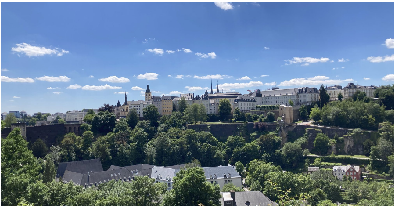
View of Luxembourg City.

At the same time, the city is almost “frightening” as the social fault lines are hidden. What and where are the contradictions? All cities have