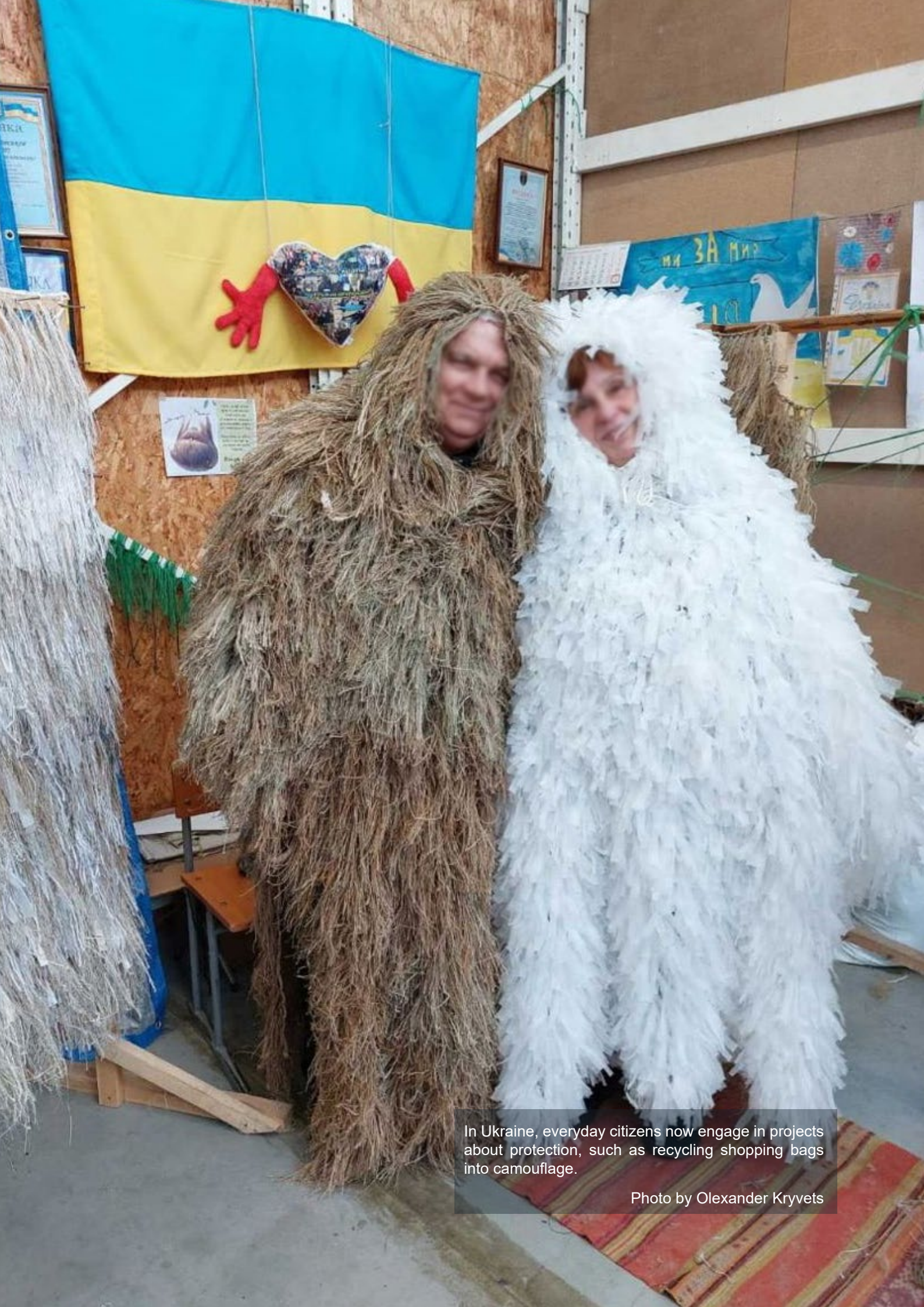
In Ukraine, everyday citizens now engage in projects about protection, such as recycling shopping bags into camouflage.