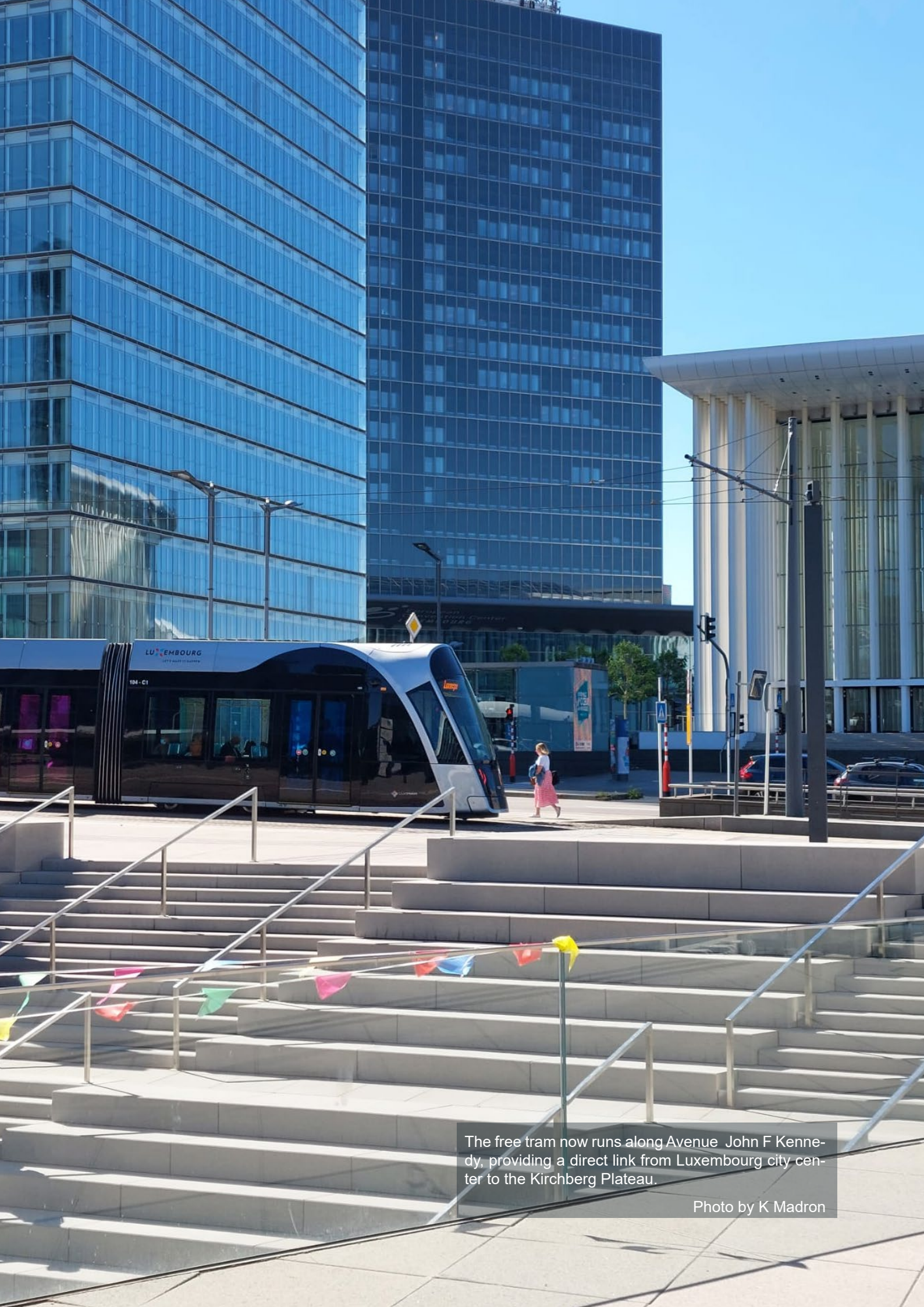
The free tram now runs along Avenue John F Kennedy, providing a direct link from Luxembourg city center to the Kirchberg Plateau.