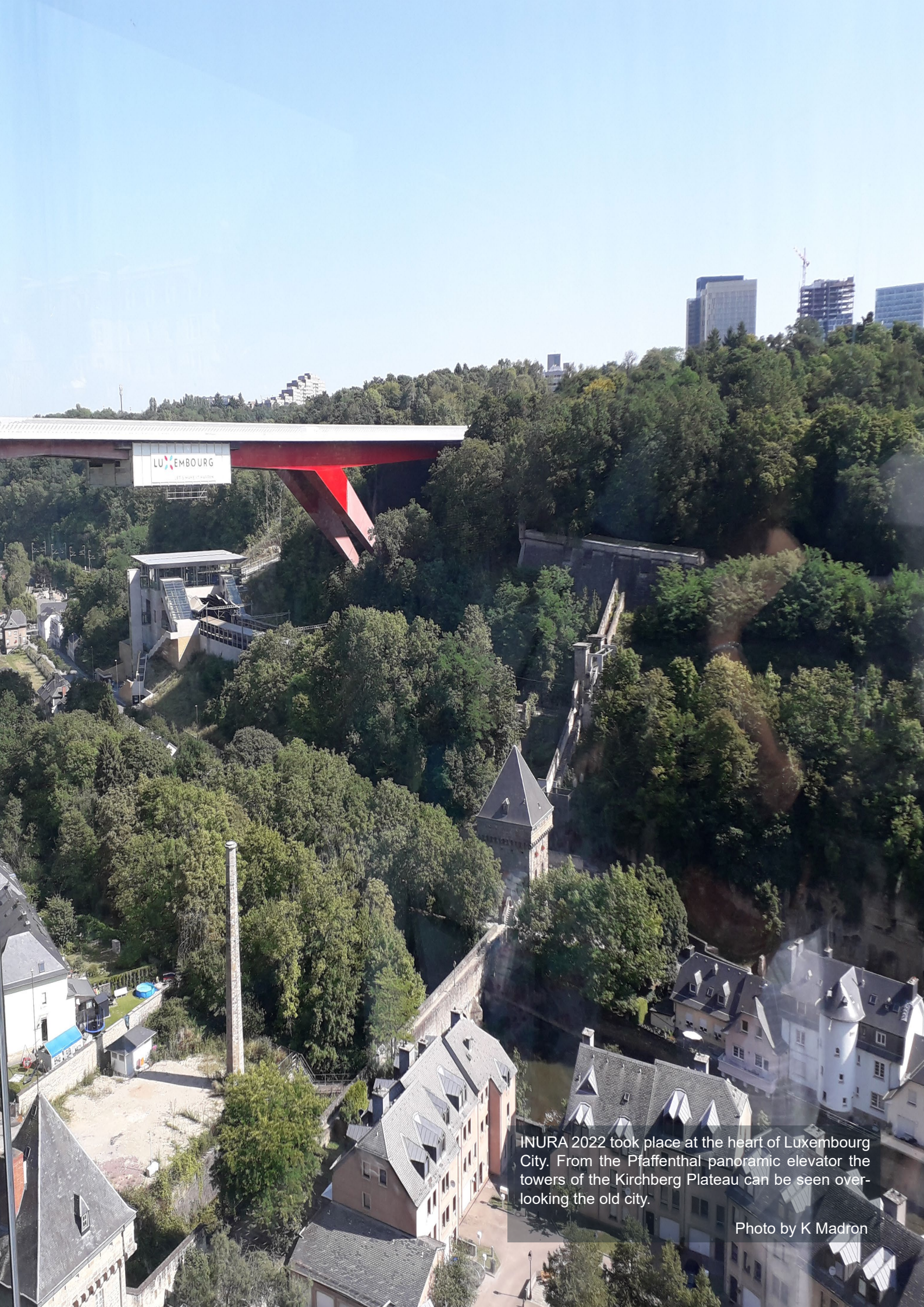
INURA 2022 took place at the heart of Luxembourg City. From the Pfaffenthal panoramic elevator the towers of the Kirchberg Plateau can be seen overlooking the old city.