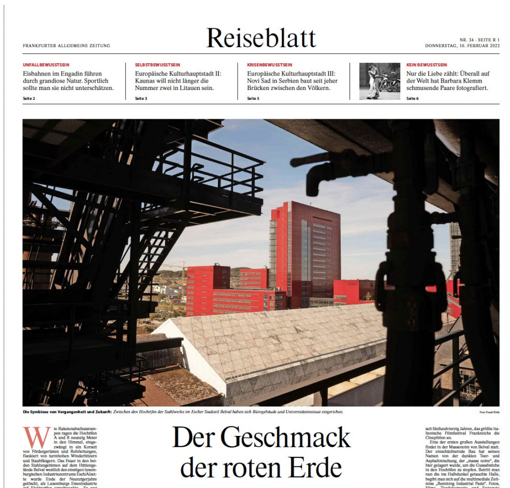
Figure 1: Another outsider’s view of Luxembourg published in the travel section of the daily German newspaper, the Frankfurter Allgemeine Zeitung (February 10, 2022), finding both the glossy and the rough

The PDAT perfectly illustrates the constraints of local complexities being assessed by observers from outside. As members of the government’s official Advisory Board on Spatial Development (CSAT), we were introduced to the