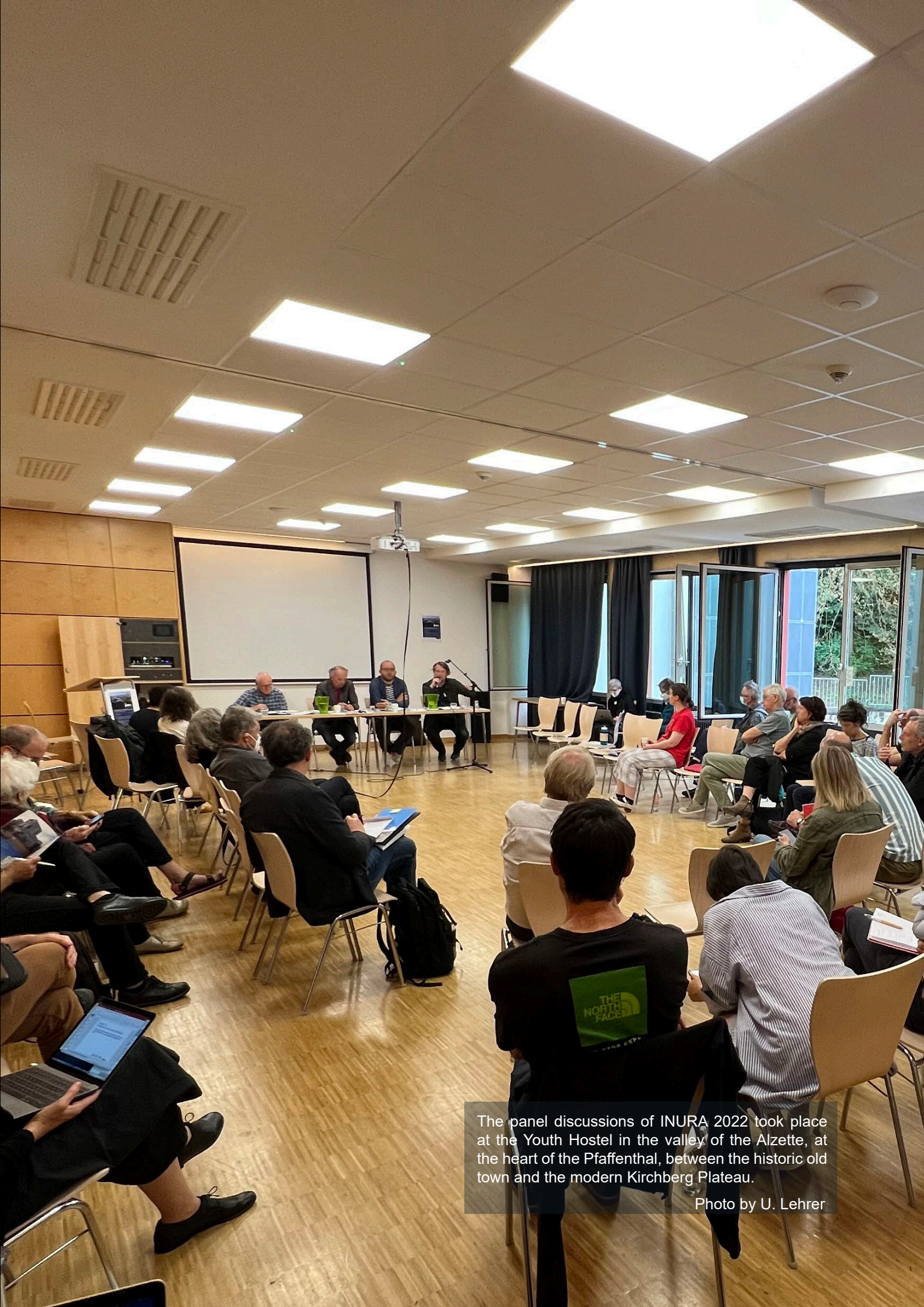
The panel discussions of INURA 2022 took place at the Youth Hostel in the valley of the Alzette, at the heart of the Pfaffenthal, between the historic old town and the modern Kirchberg Plateau.