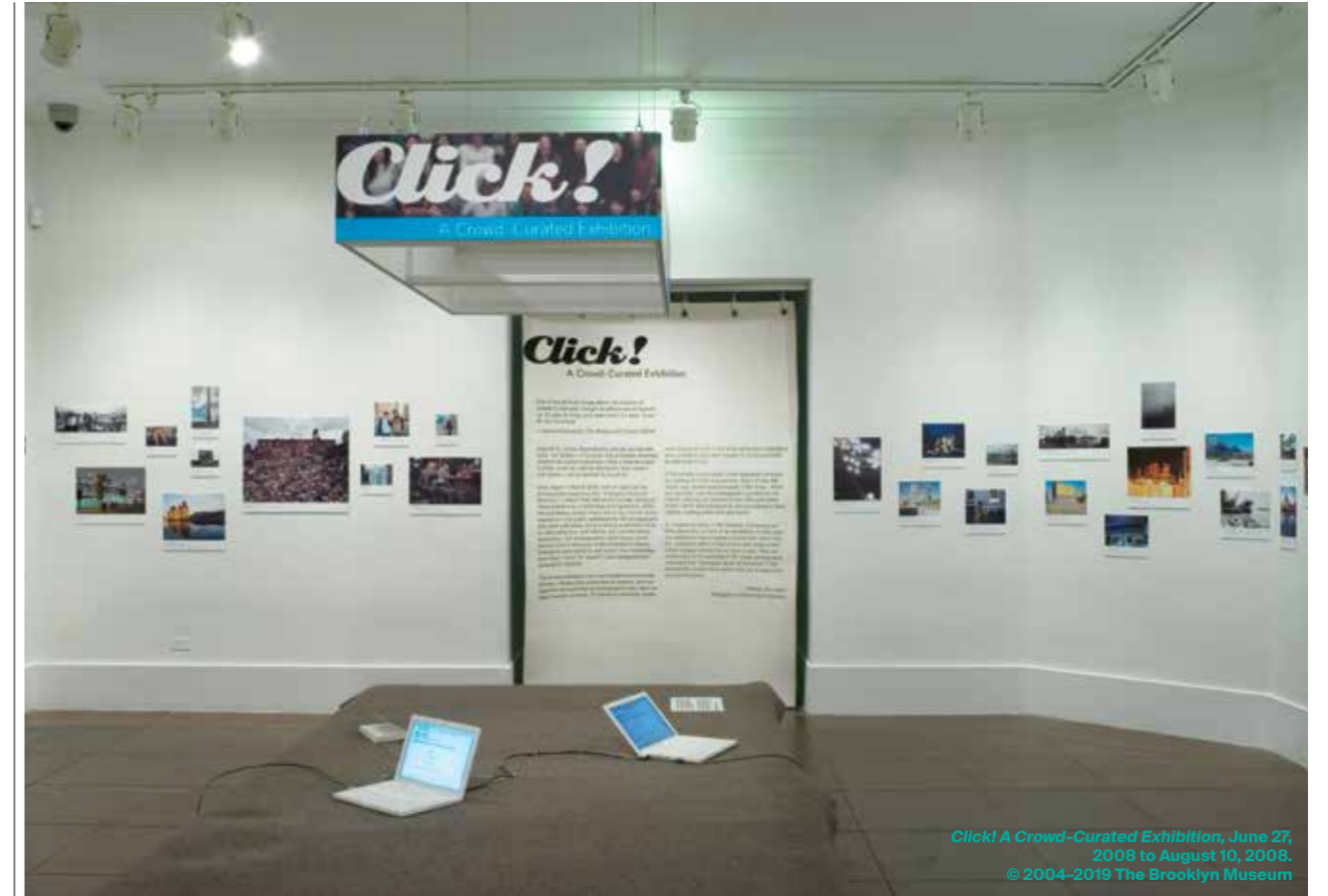
Click! A Crowd-Curated Exhibition , June 27, 2008 to August 10, 2008.

The Worcester City Art Gallery and Museum (United Kingdom) launched Top 40: Countdown of Worcester's Favourite Pictures . The team of designers purposefully created the Top 40 with minimal labels, but included voting stations in the middle of the gallery where visitors could use paper ballots to vote for