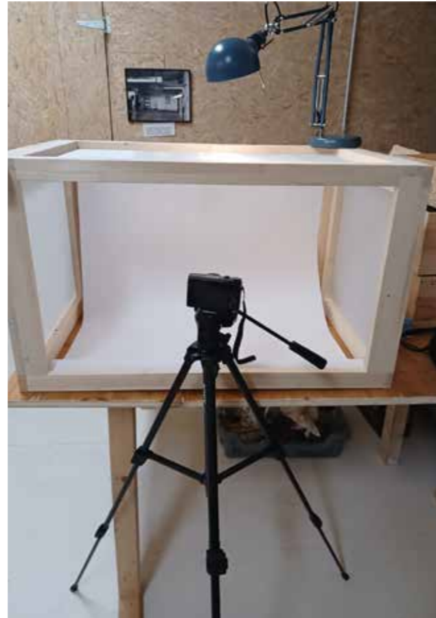
Portable Photo Booth for Object Collecting, Community Workshop in Esch-sur-Alzette.

The relevance of the visitors/users may be even more direct in the creation of new projects. Developed by Shelley Bernstein, Click! A Crowd-Curated Exhibition was a participatory exhibition at the Brooklyn Museum in 2008. Based on the concept that a diverse crowd is often wiser at making decisions than expert individuals, the project began with an open call for photographs depicting the changing faces of Brooklyn.