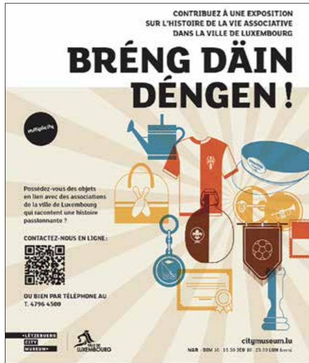
Poster: Bréng dain Déngen , Luxembourg City Museum.

Likewise, the Luxembourg City Museum initiated a collect called Bréng dain Déngen (Bring Your Thing) to prepare its 2022 exhibition on the history of associations. Its curator, Gilles Genot, first relied on a specific site where members of the community could bring any object connected to the association. Museums can also rely on public participation to obtain information and additional research on objects.