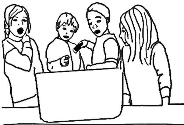
Fig. 3 Collective joy and surprise at observing magnified fleece fabric with a digital microscope