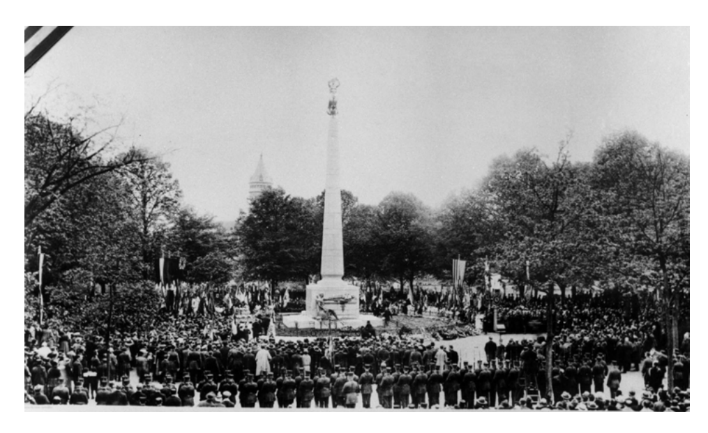
Fig. 9: Inauguration of the »Golden Lady« at the heart of Luxembourg City, 1923.