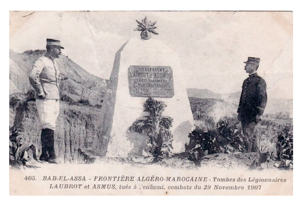
Fig. 3: Beyond cemeteries: Placing heroes' graves at the border. French postcard, 1907. Public domain.