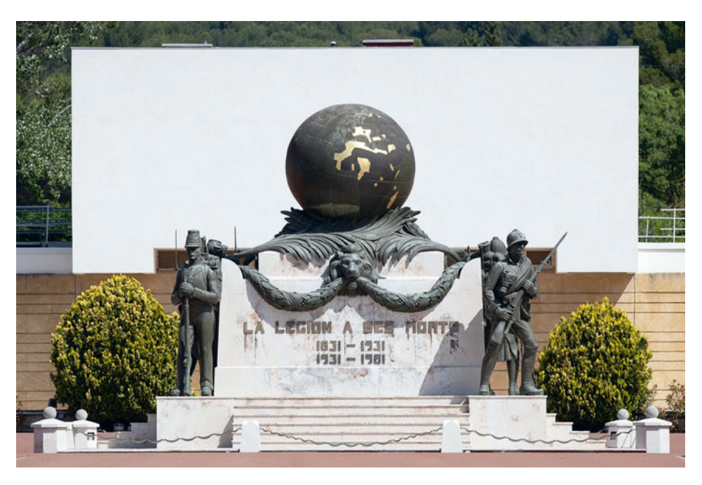
Fig. 4: The French Foreign Legion's monument aux morts in Aubagne (Bouches-du-Rhône), 2015.