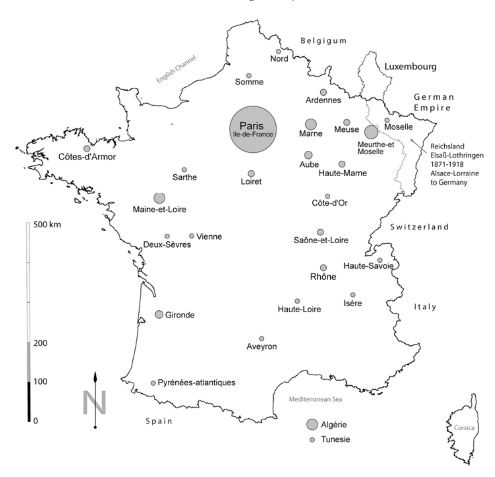
Fig. 6: Where did they go? Recruitment offices (by current French department) used by Luxembourg-born legionnaires who died in the Great War (n=168). Map by T. Kolnberger & M. Helfer (University of Luxembourg).

The places of birth of these Luxembourgish soldiers are distributed fairly equally across the Grand Duchy, with concentrations in the densely populated industrial south and in the capital (Fig. 5). The places of the recruitment offices indicate the spread of Luxembourg-born immigrants mostly in the northern half of France, with the metropolitan area of Paris forming a hotspot (Fig. 6)<sup>71</sup>. According to census data, there were 19,139 Luxembourgers living in France in 1911 and 12,499 in Reichsland Elsaß-Lothringen in 1910<sup>72</sup>.