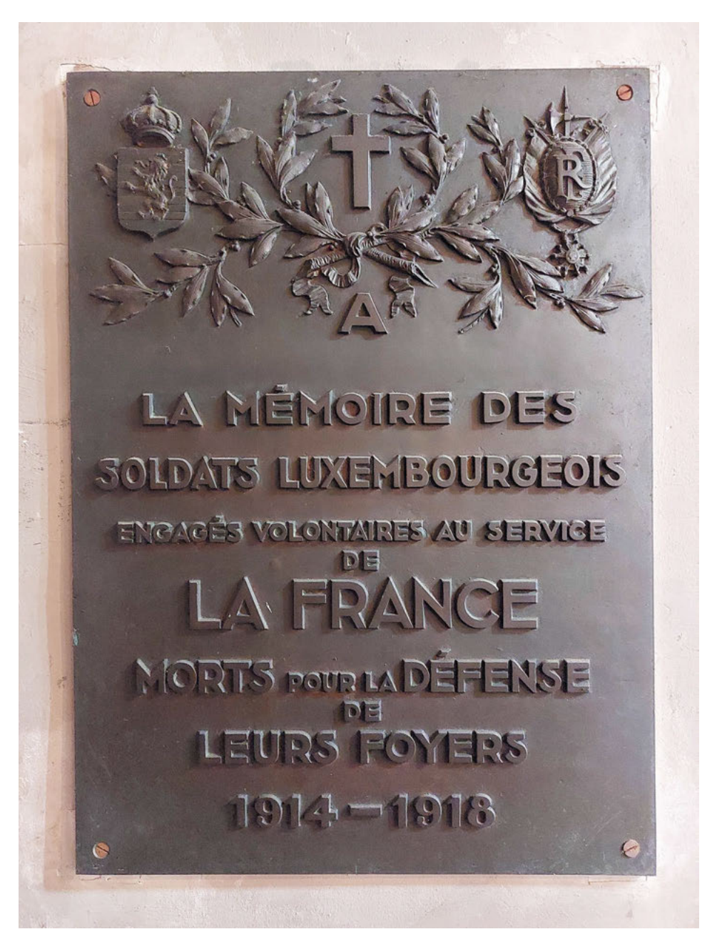
Fig. 11: Commemorative plaque in the Church of Saint Joseph l'Artisan in Paris. Photo courtesy of Jürgen Finger, Paris 2022.