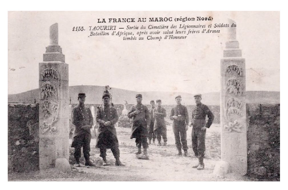
Fig. 2: At the garrison: legionnaires at the entrance of a cemetery in Taourirt, northwest Morocco. French postcard, 1912. Public domain.