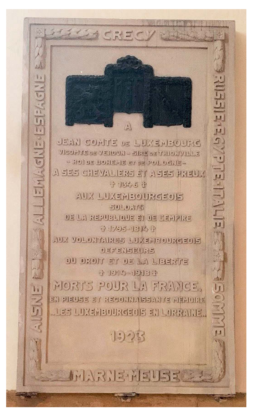
Fig. 10: Commemorative plaque inside the Church of Saint Maximin in Thionville. Photo courtesy of Céline Schall, Thionville 2020.