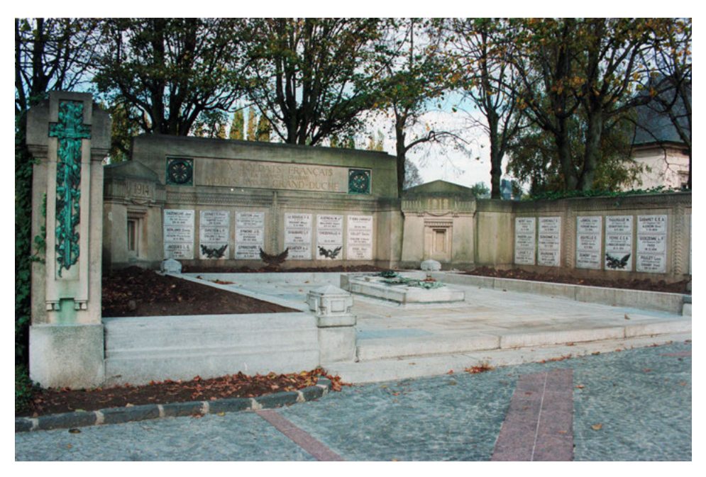
Fig. 8: Monument for French soldiers who died in the Grand Duchy, and the »Unknown Luxembourgish Legionnaire«, at the Notre-Dame cemetery in Luxembourg City, 1993.