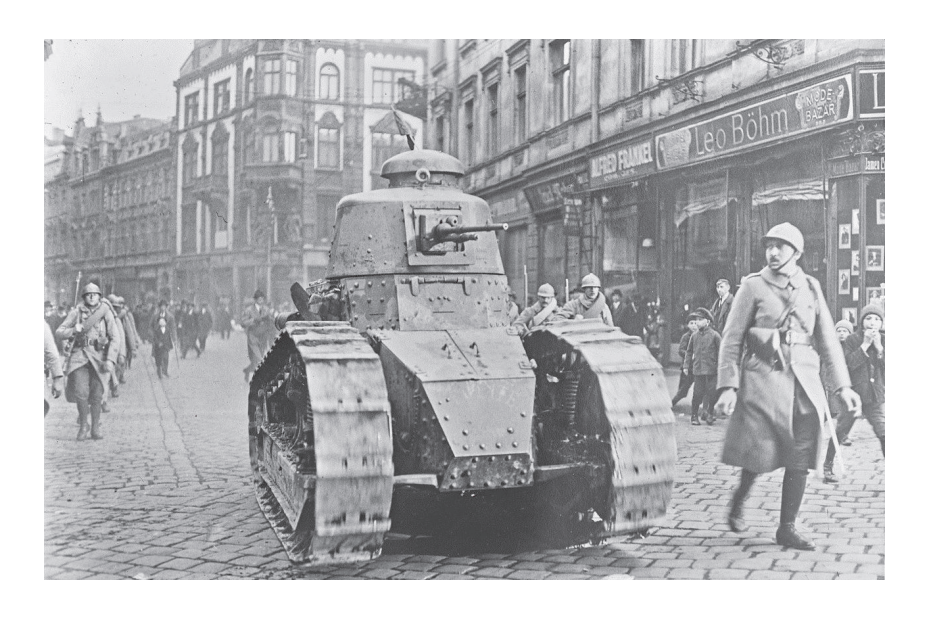
French patrol in Katowice/Kattowitz during the plebiscite of 20 March 1921.

However, calling on Upper Silesians to decide on remaining with Germany or joining Poland did not defuse local tensions. As a matter of fact, both before and after the plebiscite of 20 March 1921, Polish insurgents clashed with German paramilitary forces in order to influence the outcome. Putting the region under international administration for at least a year before holding the plebiscite was supposed to prevent this eventuality, and provide local populations with a 'cooling off period'. In practice, the Inter-Allied Commission did little to calm nationalist mobilization. Quite to the contrary: while the French, whose contingent was by far the biggest, more or less openly backed the Polish insurgents, the British and Italian detachments tolerated the armed activities of right-wing German Freikorps . The results of the plebiscite showed another limitation of the plan