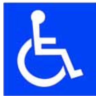
Figure 1. International Symbol of Access (ISO), 1969

vironment, spatial mobility, and product use. Such considerations are particularly important in campus planning, restructuring facilities, and building projects. Just as ramps facilitate access for a wide range of users, from parents with prams to wheelchair users to delivery personnel, signage can assist everyone to navigate both familiar and unfamiliar spaces. For example, the International Symbol of Access facilitates individuals' mobility and provides daily interactions with issues of accessibility, even as it represents the most prevalent symbol of disability worldwide (Ben-Moshe & Powell, 2007).