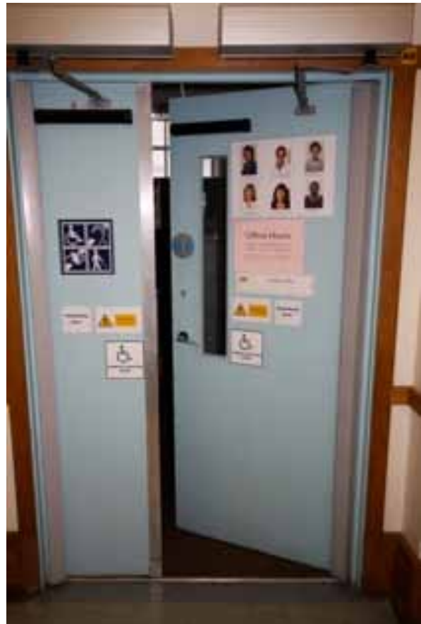
Figure 6. Disability & Well-being Office (LSE)