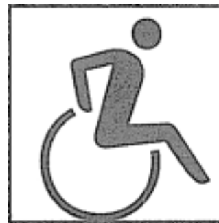
Figure 2. International Symbol of Access (MoMA), 2009

The diverse local interpretations of this icon mirror the shift from exclusion to inclusion of disabled people in the human rights revolution: whereas the traditional icon displays an object (the wheelchair), newer icons show the human user as an active rider—asserting the primacy of personhood and participation (Powell & Ben-Moshe, 2009). Symbols, buildings, and legal conventions all indicate the significant transformation in disability paradigms from medical to social models and from exclusion to inclusion.