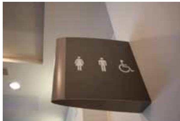
Figure 3. Access Signage (LSE)

Nicola Martin says the Disability Discrimination Act, which stipulates how public authorities should act proactively on disability equality issues and tackle institutional disability-related discrimination, was crucial in expanding these services, as the university was required to establish a Disability Equality Duty Action Plan (interview, September 2, 2010). While other UK universities, such as Leeds, have well established and internationally-known disability studies research groups, the LSE relies on collaboration among many London universities, made possible through the Disability Equality Research Network, to bring disability studies scholarship to campus and to involve students from a wide variety of disciplines and countries.