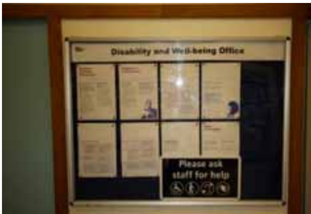
Figure 7. Disability Information Board (LSE)

Good practice in the work of service providers that are “barrier-specific” instead of “impairment-based” are transmitted via the National Association of Disability Practitioners, a professional association for disability and support staff in further and higher education. More broadly, the UK’s Equality Challenge Unit (ECU) 4 helps