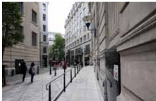
Figure 4. Ramp (LSE)