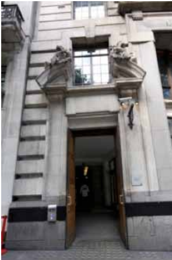
Figure 5. Automatic Doors (LSE)