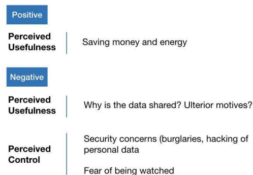
Figure 5: Most used arguments in favour of and against acceptability of the scenario “smart thermostat”