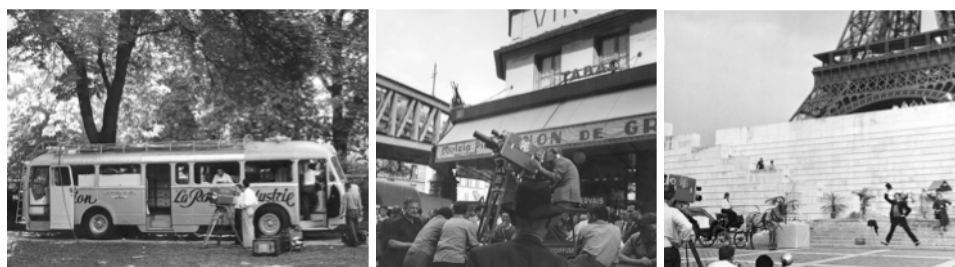
Fig. 6-8. Pictures showing an outside broadcasting van by Radio Industrie, an RTF camera team filming a street location and the live broadcast of the cabaret 'Stars in the Sky' staged in front of the Eiffel Tower on the first night of 'Paris Week' (Tuesday 8 July 1952).