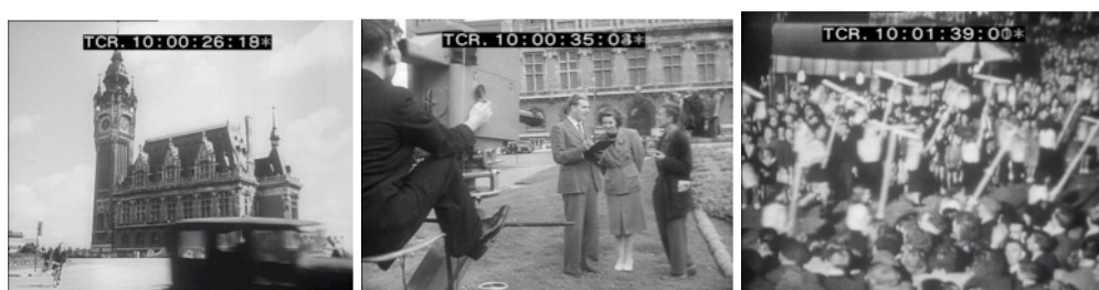
Fig. 1-3. Screenshots from the BBC film The Calais Experiment (1951) showing the ‘Hôtel de ville’ in Calais which formed the coulisse for the first trans-Channel television transmission in August 1950.