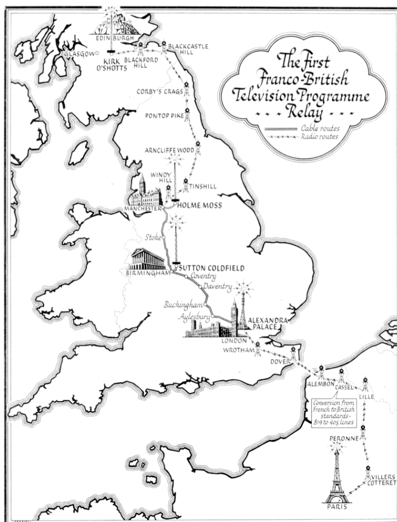
Fig. 5. Map showing the chain of relays for 'Paris Week' in July 1952.

decided during a meeting in London in July 1951 to stage the so-called 'Paris Week' in July 1952. Jean d'Arcy was designated official French Liaison Officer for the 'Paris Week' operation by Wladimir Porché on 19 November 1951, and Martin Pulling was his British counterpart. 14 During several meetings of the Liaison Committee in London and Paris, all technical, organisational and programme related issues were discussed in detail. In between, tests of the technical infrastructure (especially OB equipment, radio links and standards converters) were conducted and site visits to planned film locations were realised which certainly fostered mutual familiarisation between the British and French teams. As another symbol of collaboration, the French 'speakerine' Jaqueline Joubert was invited as guest announcer for one week at the BBC and, respectively, Sylvia Peters visited the RTF a few weeks later. Jean d'Arcy even arranged a meeting between Richard Dimbleby and Etienne Lalou, the two elected presenters of the Paris Week, in order to harmonise their prepared commentaries, as Waldimir Porché wanted to see them in advance (much to the surprise and astonishment of Richard Dimbeby). 15 But most importantly, both sides reached an agreement concerning the costs of the 'Paris Week' operation which determined that RTF had to meet 1/3 of the expected costs (2,570,000 FF) while the BBC accounted for 2/3 of the costs (5,141,000 FF). 16