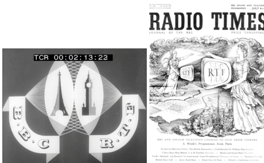
Fig. 9-10. The iconography of the televisual 'entente cordiale' plays with national emblems: the Eiffel Tower and Big Ben mirror each other in the televisual lens, Britannia and Marianne greet each other while holding a television screen showing the logos of the BBC and RTF in their hands. Source: left: 'Paris Week' as front-page motif for the BBC magazine The Radio Times , July 1952, and right: as opening sequence of a documentary produced by the BBC film unit in 1953.

I hope, next time – if there is a next time – that a great many of our initial troubles will have been righted. I think that everyone on our side worked tremendously hard under unbelievable difficulties. I was rather doubtful in the first few days whether we were straining the entente cordiale a little too far but I think that a friendly last night proved that we have made many friends among the French. 27