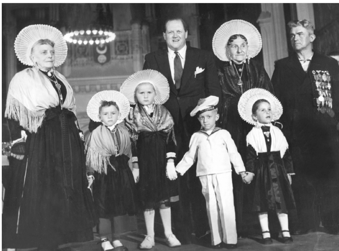
Fig. 4. Television crosses the Channel: BBC television presenter Richard Dimbleby with a Calais family in traditional costumes and a highly decorated French veteran.