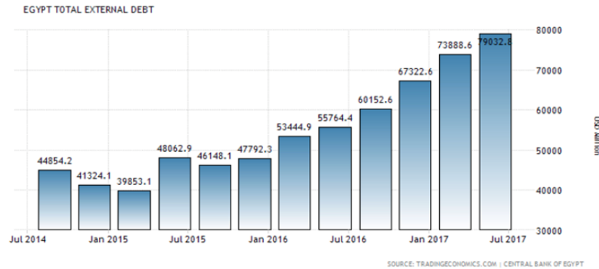
Graph (3) Egypt Total External Debt. 188

The second aim of the loans is to initiate high-labor infrastructure projects. The loans should be invested in building airports, railroads, solar energy projects, schools, universities, and hospitals. This type of investment will not only raise the level of infrastructure in Egypt to accommodate an extra couple of million of Syrians, but will also provide many direct and indirect job opportunities for newcomers. In 2016, the solar energy industry in the US successfully employed more than 250,000 workers. 189 Investing in the solar energy sector in Egypt could accommodate similar numbers. 190 There is high potential in Egypt to invest in this sector, as solar power in Egypt is available all year round. 191 Emulating Frankfurt airport in Egypt as a transit station to connect Europe to Africa will provide at least 20,000 direct jobs. 192 This number could lead to 80,000 indirect jobs. 193