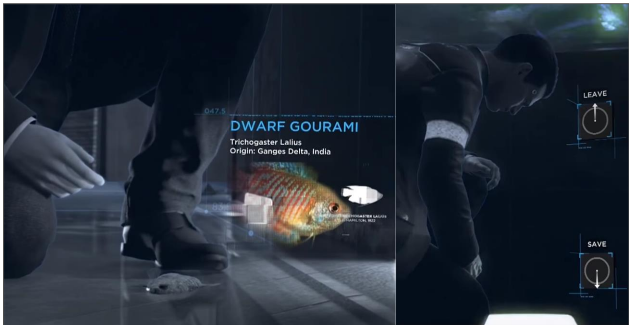
Figure 3. Screenshots of chapter 1 “The Hostage” in Detroit: Become Human . Connor examines the fish and he (the player) can decide to leave or to save it.

incident. Percentages display the worldwide decision behavior of players who contributed their data through the PlayStation network. Retrieved August 24, 2018 from the university's PlayStation account.