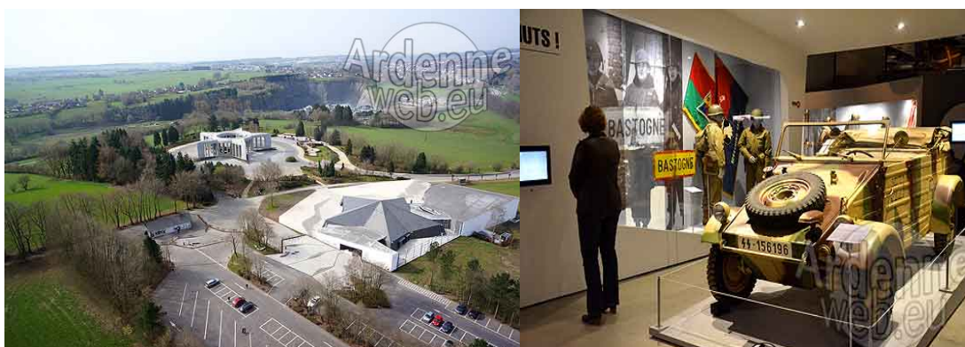
The Bastogne War Museum is a reference to understand the Battle of the Bulge in 1944-1945.