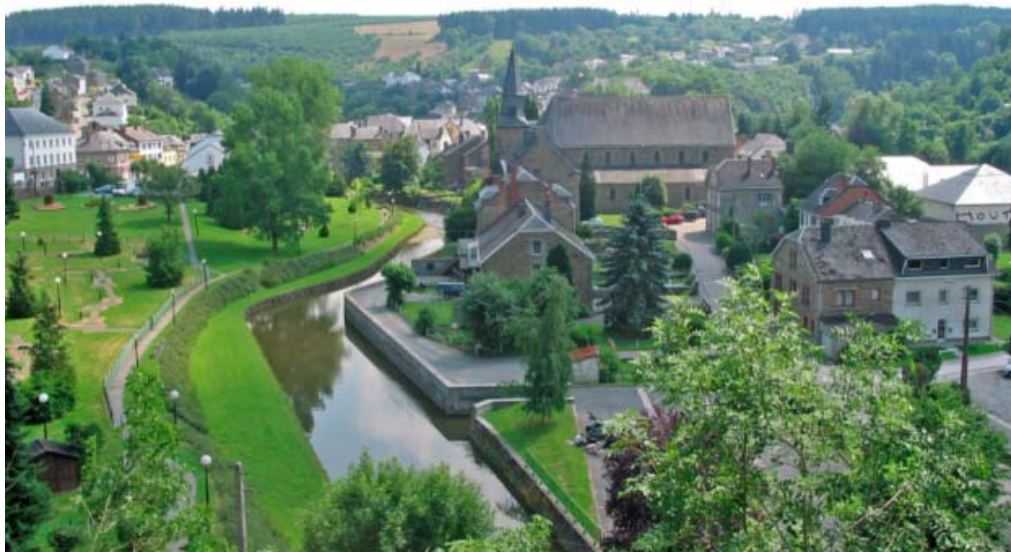
Sight of Houffalize, little Ardennes town, along the Ourthe river.