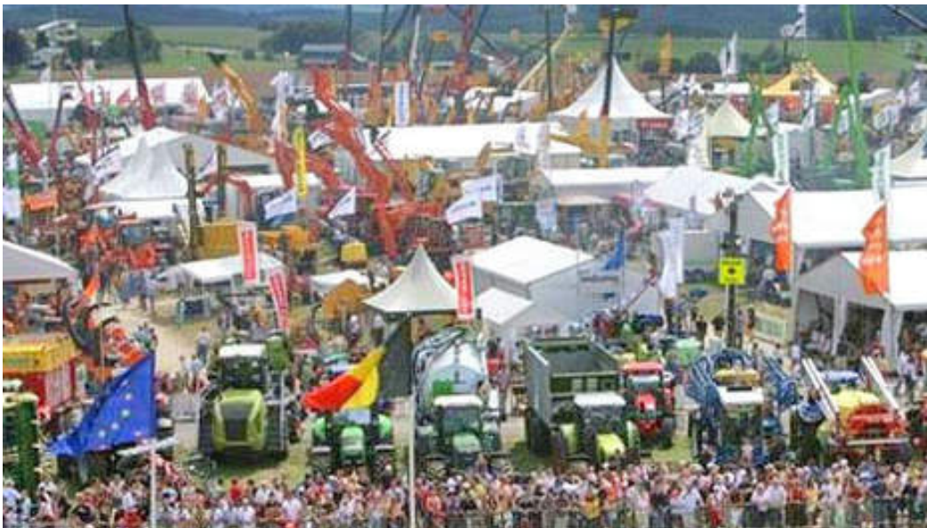
Sight of the Libramont fair.