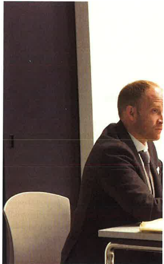
On the le