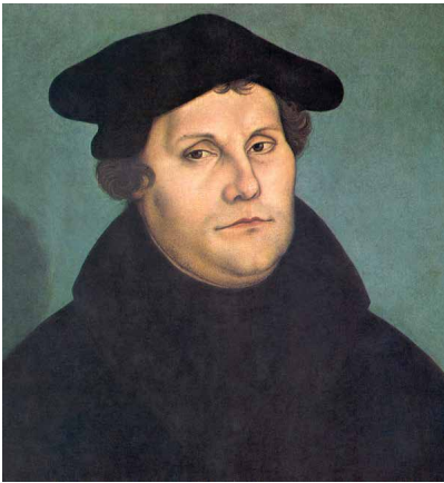
Martin Luther by Lucas Cranach the Elder