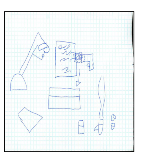
Fig. 5: getting supplies