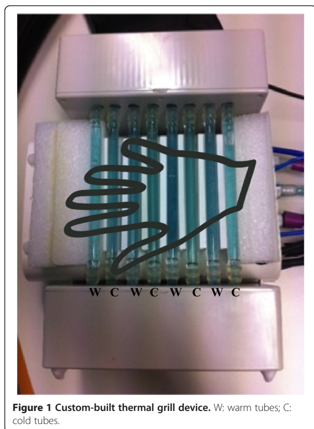
Figure 1 Custom-built thermal grill device. W: warm tubes; C: cold tubes.

combination of 15°C and 41°C, instead of individualized temperatures defined in association with previously assessed thermal pain thresholds (as described in studies using Peltier-driven thermal grills; Bouhassira et al. 2005). This choice was based on the circumstance that water-bath-related temperature changes are time-consuming and on the finding that larger differences between cold and warm grill temperatures allow generating reasonable pain intensities (Boettger et al. 2011; Bouhassira et al. 2005; Lindstedt et al. 2011a). The chosen temperature combination of 15°C and 41°C (difference of 26°C degrees; Boettger et al. 2011; Bouhassira et al. 2005; Lindstedt et al. 2011a) was applied throughout the one-minute trials of the experimental condition (see Figure 2). An inter-stimulus-interval (ISI) of three minutes was always respected between the trials. The same temporal procedure was applied in the two subsequent control conditions. In control condition 1, the cold temperature of 15°C was combined with the baseline temperature of 32°C, whereas in control condition 2 the warm temperature of 41°C was set together with the 32°C input (see Figure 2). As an alternative to previous research procedures using single stimulations (e.g. 15°C in all thermal grill tubes) for control, we preferred providing dual interlaced temperature stimulations mimicking the spacing of the respective temperatures in the experimental 15°C/41°C phase. The order of