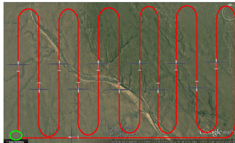
Fig. 1. Autonomous patrol flight plan - the entire area will be inspected in one round

Nowadays the huge zones of National parks in Africa is inspected, in most of the cases, by a limited number of humans patrolling in group, using ground vehicles and binoculars and facing constant danger in face of unscrupulous poachers. One potential contribution of the NOAH project is to reduce the number of people needed to cover the different parts of the Natural Parks. Furthermore, the use of the UAVs will significantly reduce the amount of time needed to check if there are potential poachers in a specific sector of the Park. Finally, from a bird view it should be easier to detect potential poaching situations.