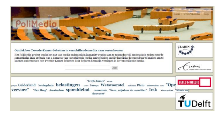
Fig. 1. Screenshot of the PoliMedia home page