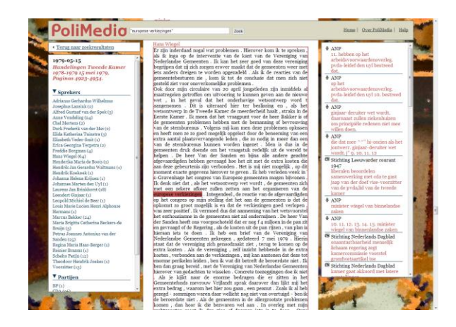
Fig. 3. Screenshot of the PoliMedia debate page