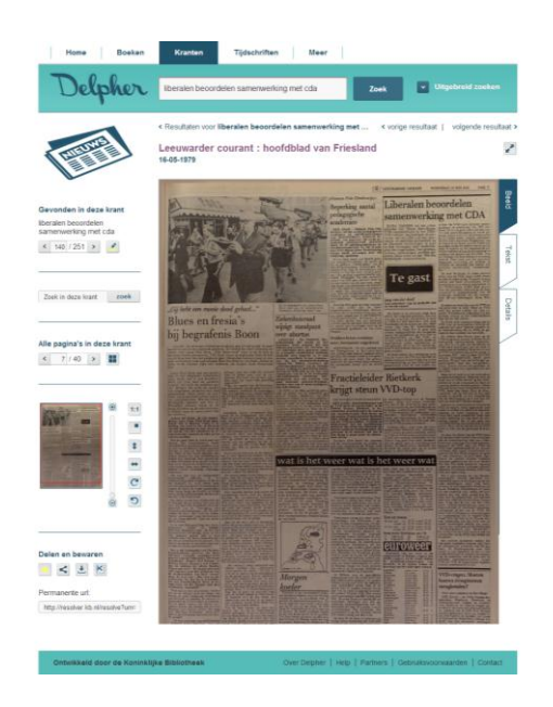
Fig. 4. Screenshot of an example newspaper in original lay-out, containing an article about a parliamentary debate.