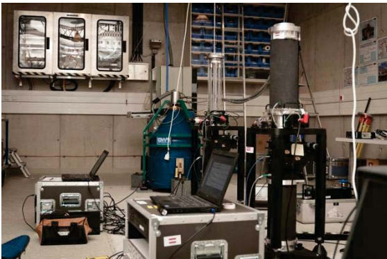
Figure 1: Absolute gravimeters side-by-side with the superconducting gravimeter at the Conrad Observatory (FG5-242 from Austria, FG5X-216 from Luxembourg with the glass tube and SG GWR C025).

Episodic absolute gravity measurements are carried out at the Conrad Observatory by the team of the Geophysics Laboratory of Luxembourg. The last-born generation of the FG5 absolute gravimeter (manufacturer Micro-g LaCoste Inc., USA) is used to determine the absolute values of the gravity acceleration, g . This is a transportable instrument (Fig. 1) measuring the free fall acceleration of a mass in a vacuum cylinder. The positions of the mass during the free fall are measured with an interferometer using an Iodine stabilized laser. A rubidium clock steered by GPS provides the accurate timing. The accuracy is approximately 2 \cdot 10^{-9} of g .