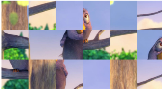
Fig. 1. Mosaic/Jigsaw game example

participant restrictions. To a limited extent this allows for a semi-pervasive experience as both players and spectators can take part. Indeed, as the games are ongoing, spectators are free to interact as they wish, perhaps just waving to people or even talking to people at the remote locations. This, in turn, may shape players' behavior.