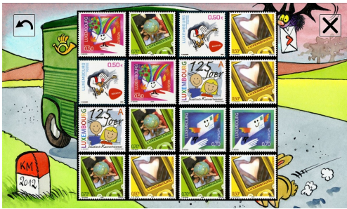
Fig. 3. Memory game example: stamps

Quizzes are another popular format and are again applied with LiveCity, in the example (see Fig.4) (know as “Whose phone is it?”) players are asked to match the phone with the right person. In this case, multi-touch is used to drag the images around. While players may be able to guess some of the answers for this, other quizzes’ players may also need to spend time finding out about contents in the museum. Additionally, this approach encourages the exchange of information between the two museums as players could be quizzed on content in the other museum. This would necessitate that players find out and discuss content together.