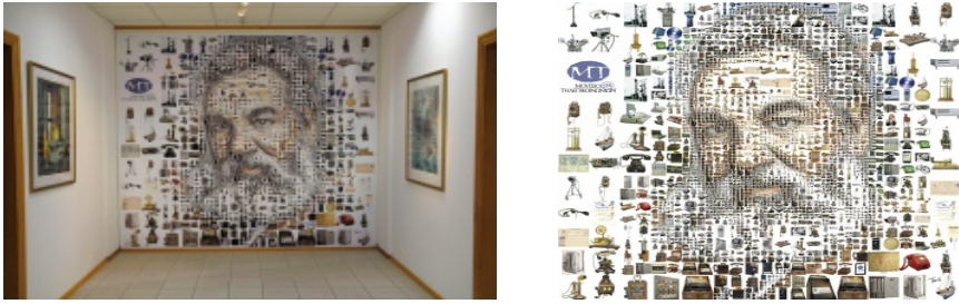
Fig. 5. The Alexander Graham Bell “build together” game concept

The previous games use the multi-touch table and video feed from a static location in the museum which could result in people being drawn away from the museum content. This problem is not unique to our proposed games and has also been noted in [20] where authors suggest that care should be taken to integrate “more closely” real world elements with game content. Therefore, in order to encourage greater exploration of the museum itself, they could be combined with mobile devices so that people must search for information within the museum and take a video or picture in order to complete the game.