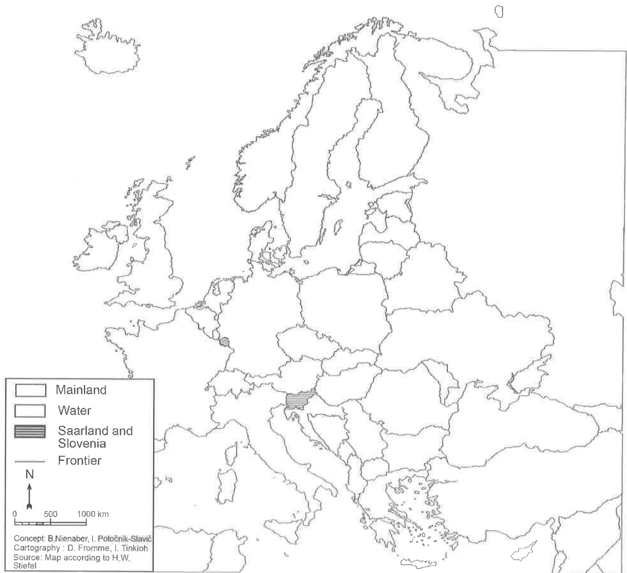
Fig. 1. Location of the case study regions: Saarland, Germany, and Slovenia.

With an area of 2,569.68 km 2 , Saarland (Fig. 1) is the smallest German federal state. Liedtke (1969: 10–11) defines its three different landscape formations: flats with monadnocks, cuesta landscapes, and valley landscapes of the Pleistocene. Geologically, Saarland is dominated by shell limestone in the south-east and west. North of these areas red sandstone can be found (Schneider 1991: map). The climate is characterised by a double transition. The region displays great var-